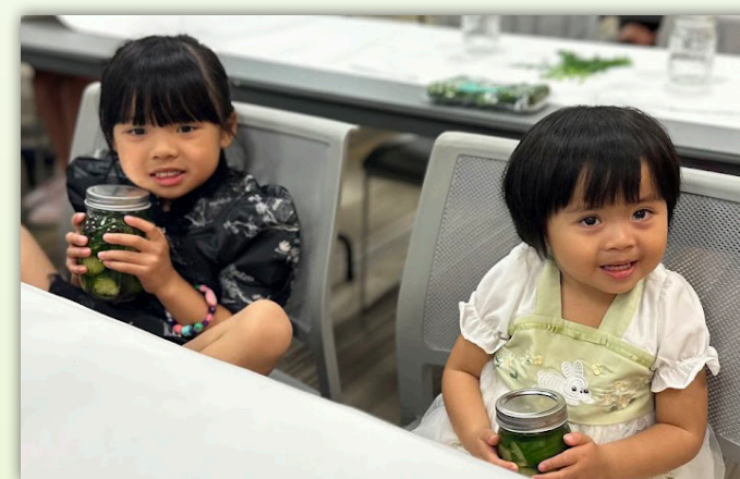
Two young patrons at a DIY pickling program!

We distributed 679 new children's books free of charge during our Poughkeepsie Children's Book Festival, visited by 1,450 people.