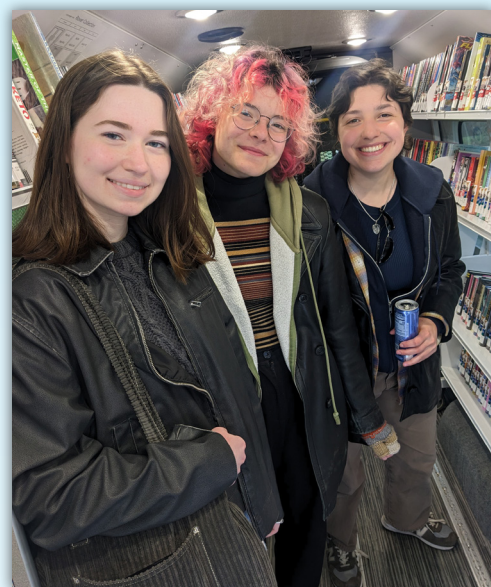
Marist students aboard Rover!