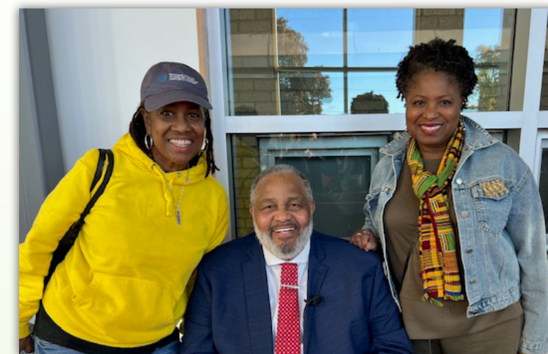
Representatives from NAACP with our 2024 Big Read flagship author Anthony Ray Hinton.

We had 462,049 virtual visits, including 389,132 hits on our website, 52,819 visits to our databases, and 20,098 views on our YouTube channel.