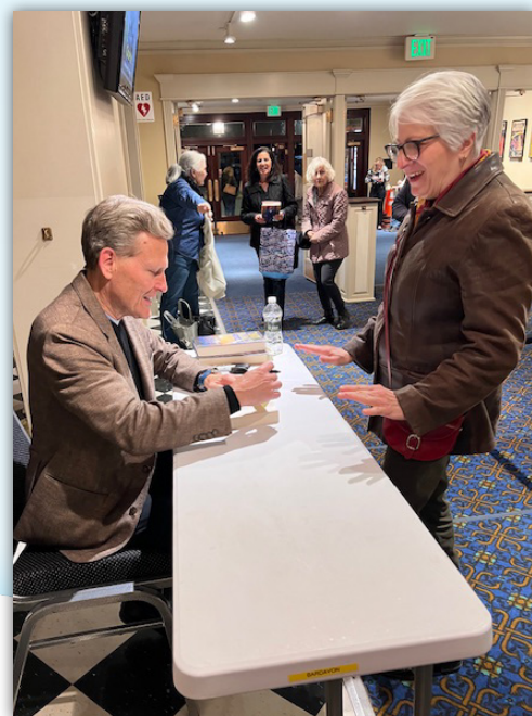
A patron has her book autographed by bestselling author David Baldacci at the Bardavon on April 26, 2024.